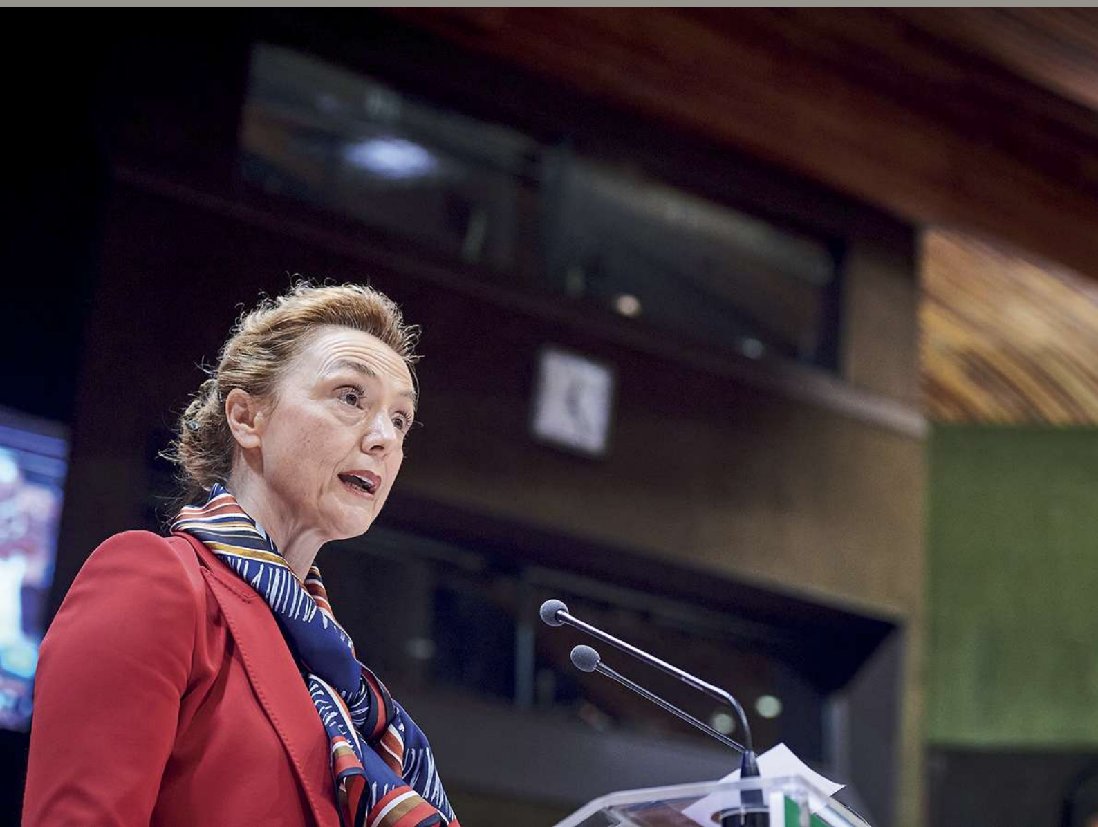
Marija Pejčinović Burić Secretary General of the Council of Europe